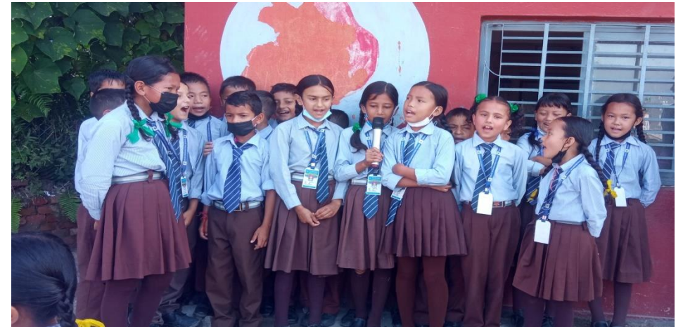
Students singing rhymes in the assembly