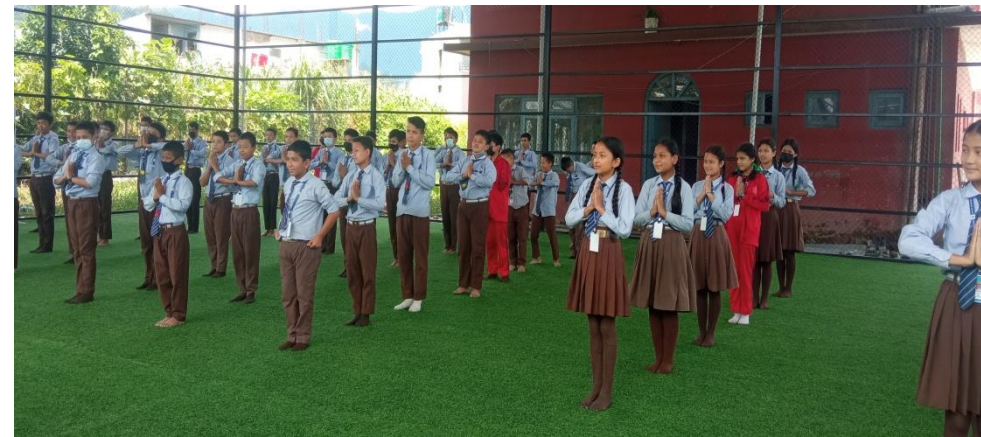
Students in Yoga class