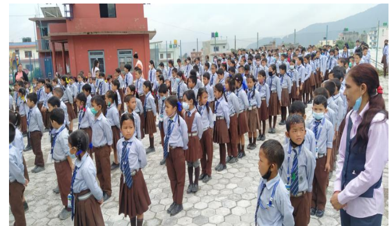
Students in Assembly